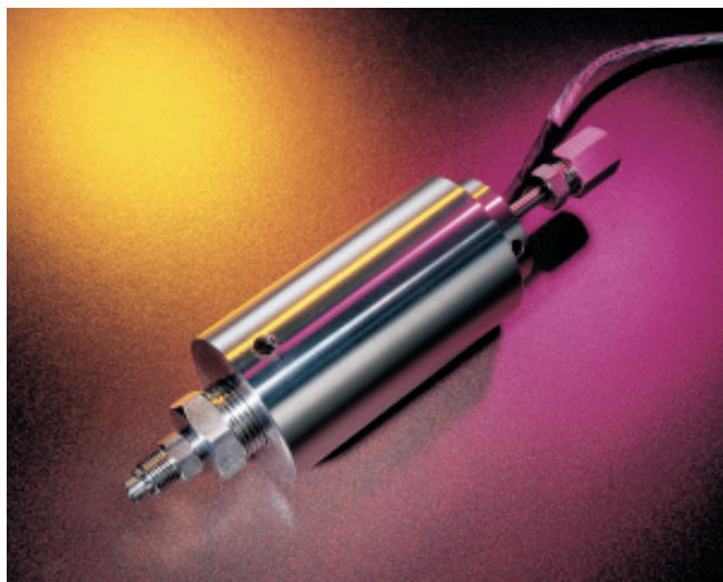
The SPL440 has recently achieved among the highest accuracy for any portable or laboratory viscometer and it is mercury free.